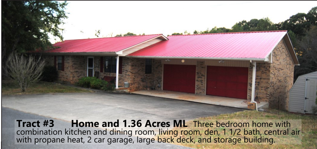
Tract #3 Home and 1.36 Acres ML Three bedroom home with combination kitchen and dining room, living room, den, 1 1/2 bath, central air with propane heat, 2 car garage, large back deck, and storage building.