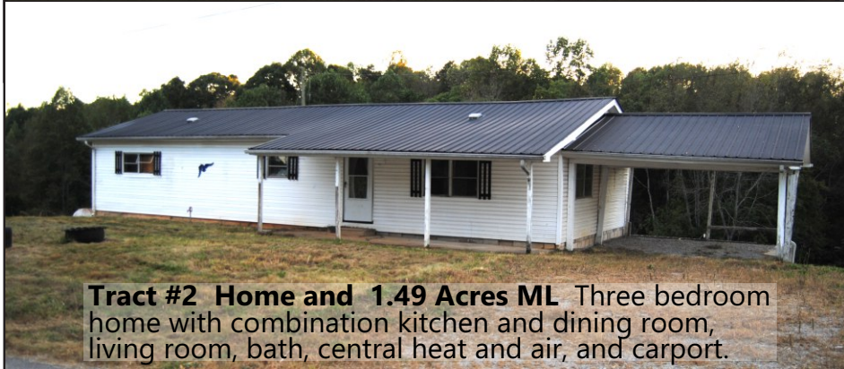
Tract #2 Home and 1.49 Acres ML Three bedroom home with combination kitchen and dining room, living room, bath, central heat and air, and carport.